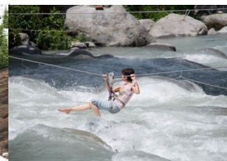
Still Water Sports